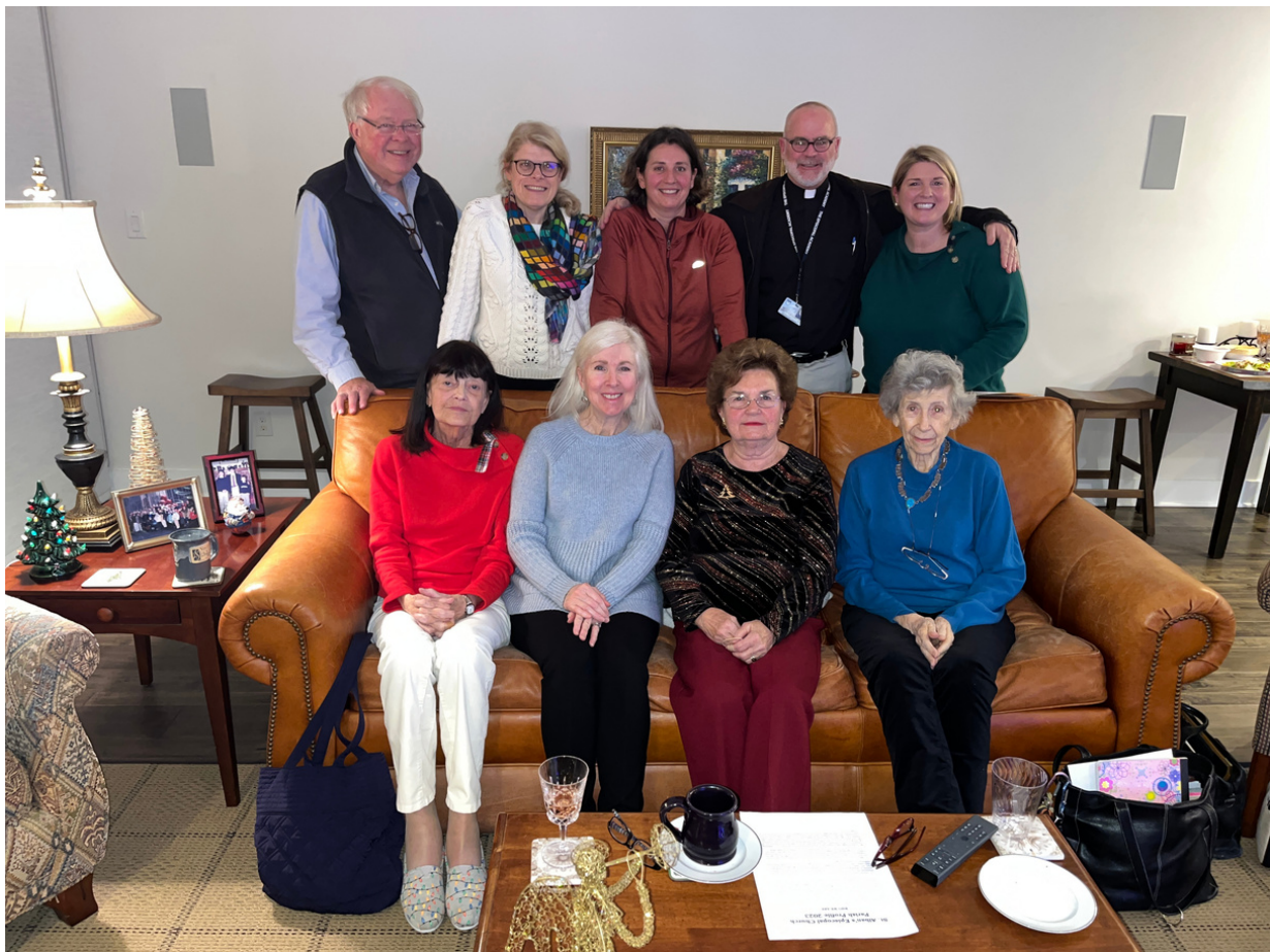
2023 VESTRY MEMBERS